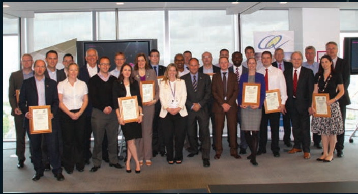
ODA receiving one of their many CEEQUAL Awards

By using independent sustainability assessment tools like CEEQUAL, project teams can change their ethos and, ultimately, improve their decision-making when planning and executing projects and maintenance works. Such tools can open their eyes to the wider repercussions that may